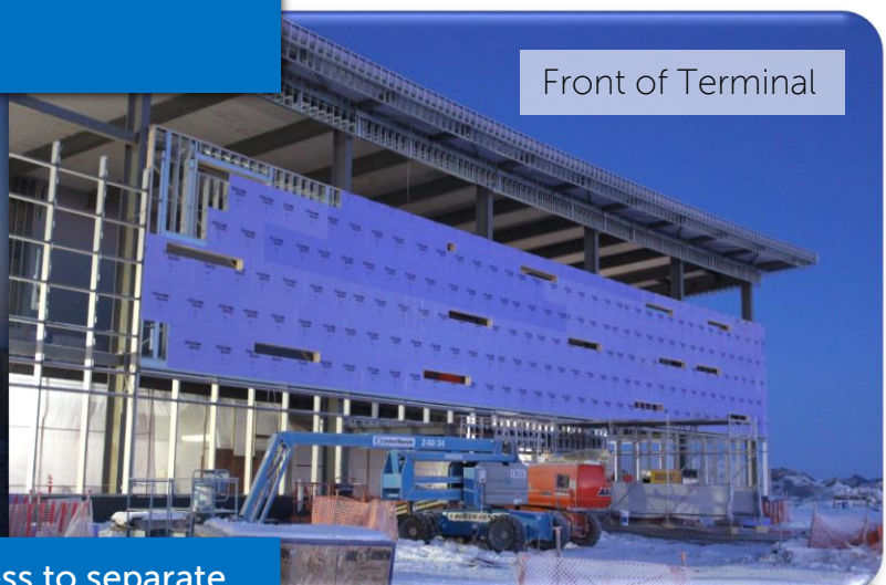
Front of Terminal

Quick Fact: Moms will have access to separate nursing and lactation rooms beyond the security checkpoint.