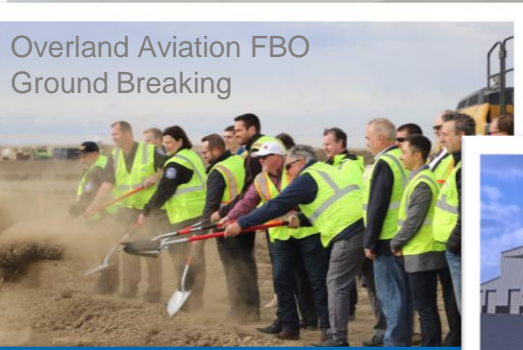
Overland Aviation FBO Ground Breaking