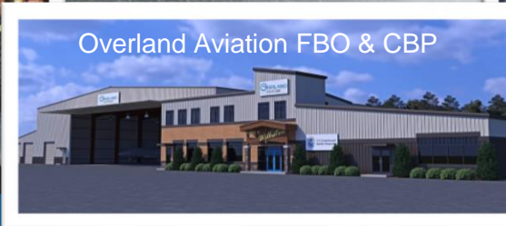
Overland Aviation FBO & CBP