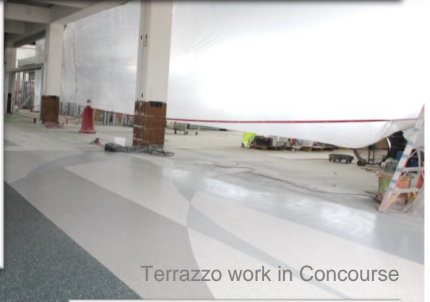
Terrazzo work in Concourse